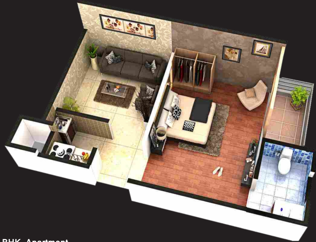
2D 1 BHK Apartment